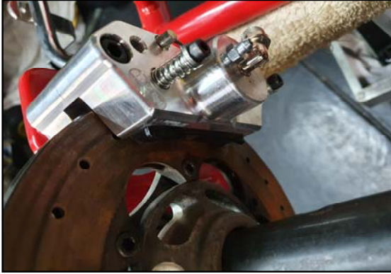
DENT 2 SPOT CALIPER FITTED TECNO KART